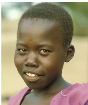
A school girl in Juba, South Sudan

BIBLES HAVE BEEN FLYING off the shelves in the world's newest nation, South Sudan – to such an extent that Bible Society had completely sold out within six months.