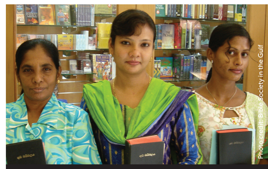
Migrant workers hold Bibles given to them by Bible Society at one of our bookshops in the Gulf.

Your generosity enabled Bible Society to distribute thousands of copies of John's Gospel and the New Testament in 14 different languages during the World Cup finals. And this year more and more Scriptures are being distributed to churches in Kuwait, Bahrain, the United Arab Emirates and Oman. Crucially, inexperienced pastors are getting quality training.