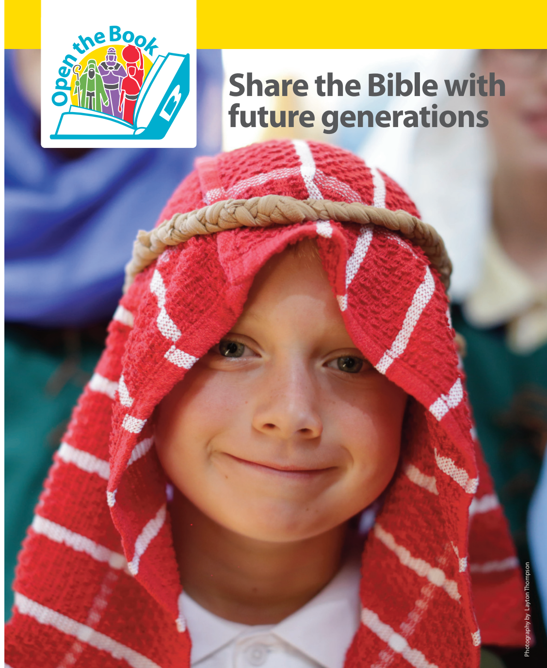
Source Code: 98707 PR000347 All Open the Book photography by Layton Thompson and Howard Wilkinson