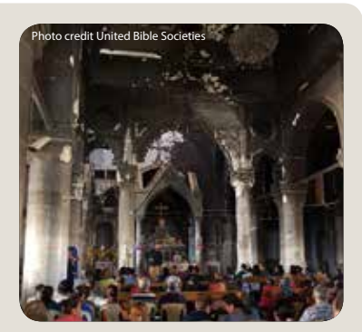
Iraqi Christians holding a service in their burned down church.

Armed police still stand outside the churches of Qaraqosh, Iraq's largest Christian city. After the ISIS invasions of 2014, Iraqi Christian numbers dwindled from over a million, to a mere 250,000 people in the whole of the country. Thousands of houses and churches were burned to the ground, and many Christians fled to the neighbouring countries of Jordan and Lebanon.