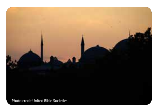
The skyline of Istanbul, Turkey's capital city.

In spite of these challenges, our team is able to run a Bible shop on one of the main streets in Istanbul, where people come in to enquire about the Christian faith.