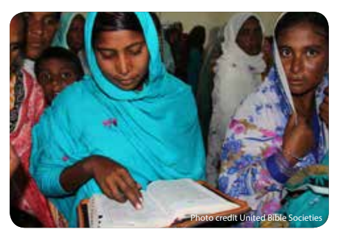
Learning to read and write together.

Pakistan is one of the most dangerous countries of the world in which to be a Christian. Although many Christians happily coexist alongside their Muslim neighbours, the threat of Islamic extremism is growing. My Pakistani colleagues live in fear every day. There's