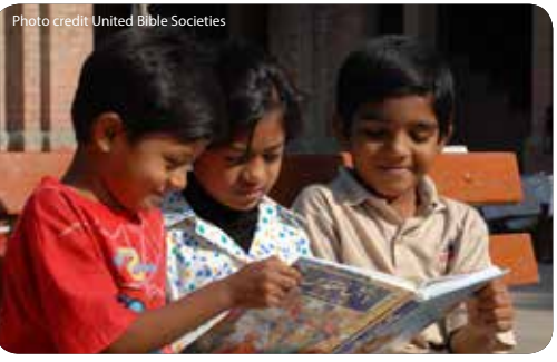
Pakistani children reading an Urdu Bible.

Thank you for your ongoing generosity, which is helping transform lives across Pakistan.