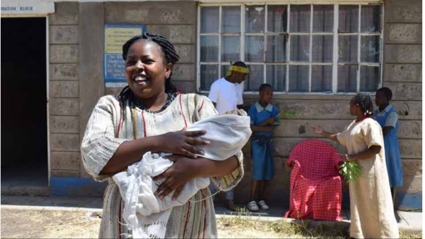
'The Wise King' story is dramatised at a school in Kenya.