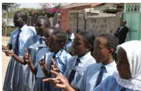
Children at a school in Nairobi perform a drama on the subject of HIV/AIDS.

Kenya's extraordinary natural beauty inspired the animated landscapes of The Lion King . This is a place where Christianity has been growing rapidly since the arrival of missionaries in the mid-19th century. The first Kenyans were ordained in 1885, and more than 85 per cent of today's Kenyans identify as Christians. Kenya also has about a third of the world's 350,000 Quakers.