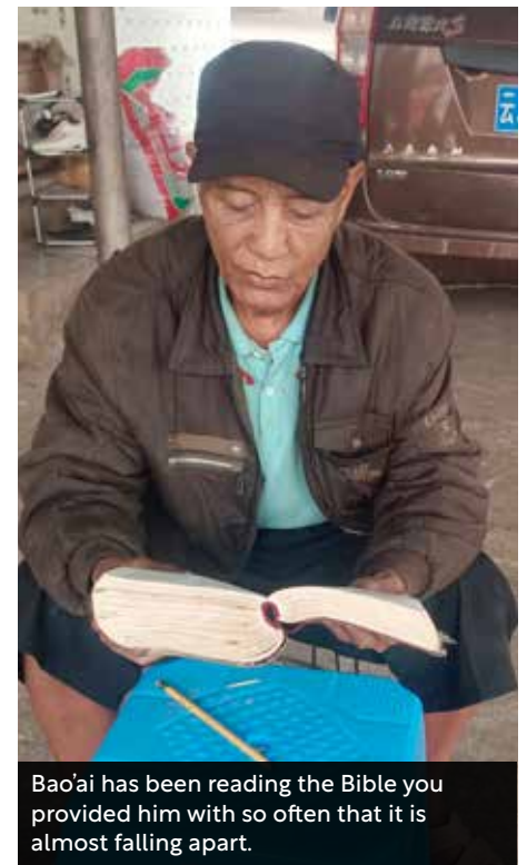
Bao'ai has been reading the Bible you provided him with so often that it is almost falling apart.