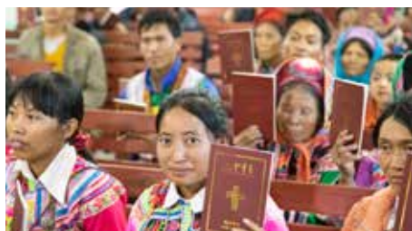
Thanks to you, these people received a Bible translated into the Gan Yi minority language.

Right now, thanks to your support, five Bible translation projects in minority languages are underway in China. And we are also awaiting the approval of the authorities to publish a Bible translation that was completed in late 2021 for communities in the region of China called Inner Mongolia.