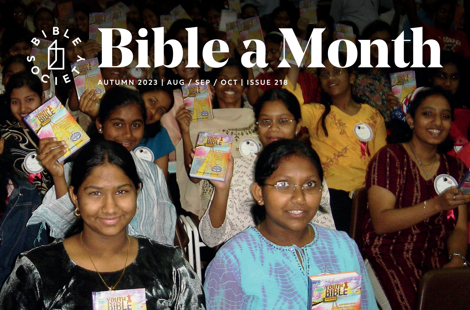
Young Nepali women from migrant-worker families receive Scriptures at the Bible Tent set up by Bible Society in Salalah, Oman.

AUTUMN 2023 | AUG / SEP / OCT | ISSUE 218