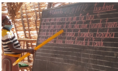
The church in Niger is growing, and one of the reasons for this is your support of Bible-based literacy classes.

Niger is one of the poorest nations in Africa and one of the toughest for Christians, who face the threat of persecution from Islamist extremists.