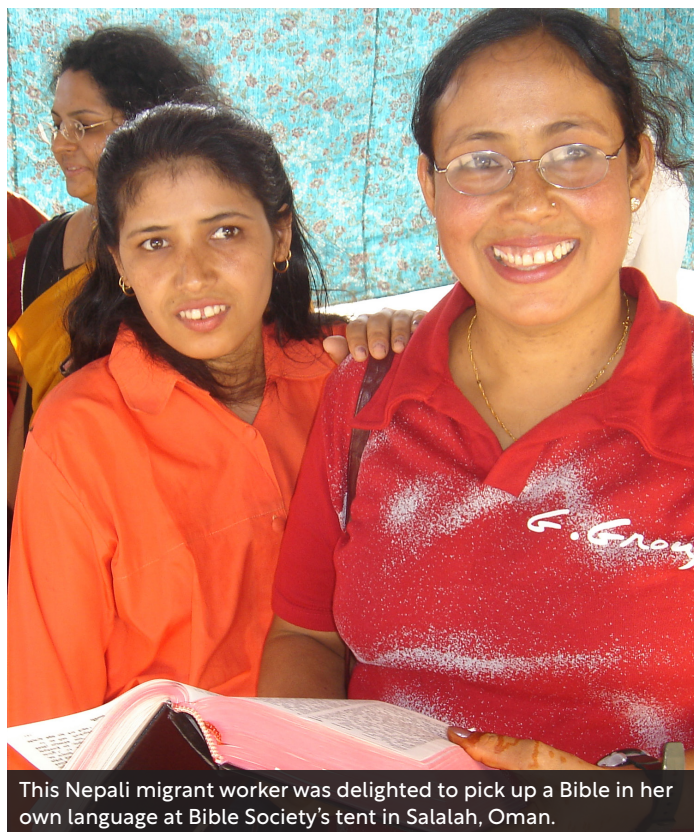
This Nepali migrant worker was delighted to pick up a Bible in her own language at Bible Society’s tent in Salalah, Oman.

We definitely could not have reached so many with the word of God if it were not for the vision and mission-mindedness of Bible a Month supporters. May God bless you.