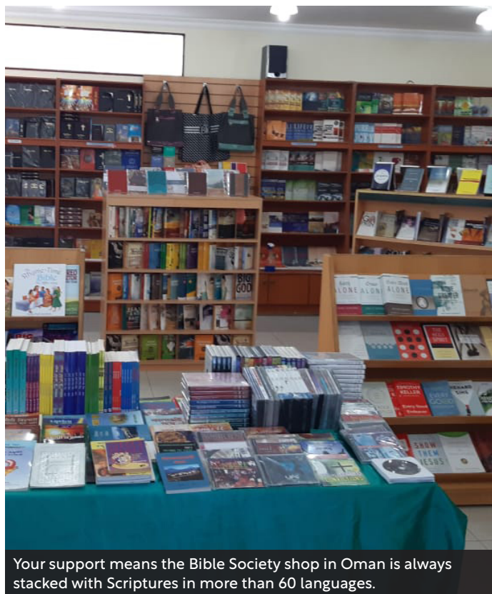
Your support means the Bible Society shop in Oman is always stacked with Scriptures in more than 60 languages.