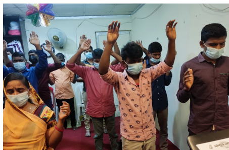
Migrant workers worship in a cramped space in the Gulf.

Thanks to your support at Bible a Month we were able to help provide copies of John's Gospel to thousands of migrant workers and football fans in Qatar during the FIFA World Cup Finals.