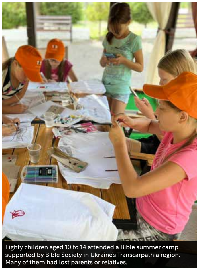
Eighty children aged 10 to 14 attended a Bible summer camp supported by Bible Society in Ukraine's Transcarpathia region. Many of them had lost parents or relatives.