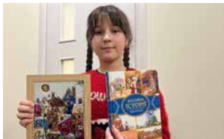
This girl was given a Bible by our colleagues in Ukraine during a trauma healing session.

It's more than a year since the war in Ukraine began. With your prayerful support, our colleagues have been working tirelessly to bring the hope of the Bible, along with basic food and medical aid, to stricken communities.