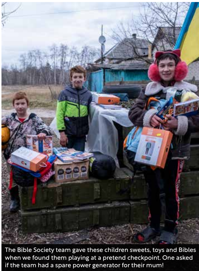
The Bible Society team gave these children sweets, toys and Bibles when we found them playing at a pretend checkpoint. One asked if the team had a spare power generator for their mum!