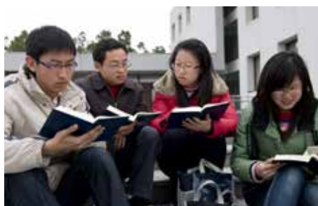
Students at a seminary in China study Scriptures in Greek provided by Bible Society.

Ninety million Bibles have been printed and distributed in China since Bible Society helped establish Amity Printing Press to print Bibles in Nanjing in 1987. And although 46 million is the Chinese authorities' estimate of the number of Christians in China, the real figure is much higher.