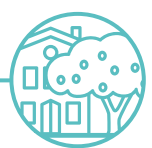
HOPE & HOME