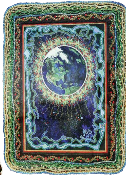
Earth from Space.