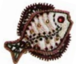
Front cover image: Fish, Sea, Animals and Birds .

written and illustrated her own children's story, as well as providing illustrations for others.