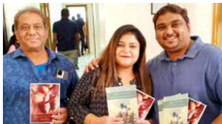
Storytelling booklets are crucial to evangelism.