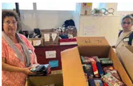
Bible workers arrange Scriptures and other aid in Israel during the war.